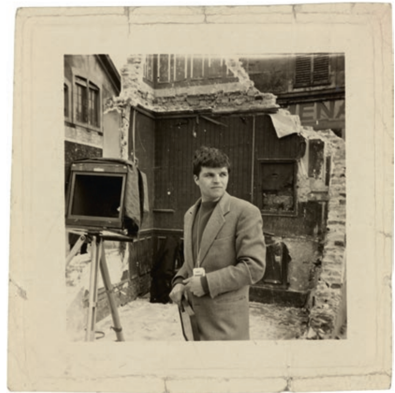
Better 5 minutes of happiness than a lifetime of conformity. Guy, Spring 1955

Mieux vaut 5 minutes de Bonheur qu'une vie bien conforme. guy Printemps 1955.